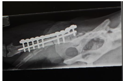
Radiograph post surgery