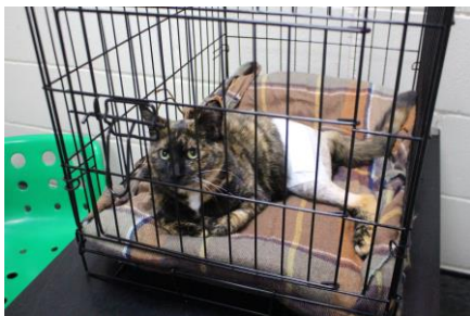
Tigs on her 2 day post op check