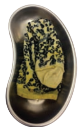
A very expensive sock that was removed from the intestines of a dog

So – as well as trying to ensure your pets don’t eat these objects, we strongly recommend pet insurance to cover you against these unexpected eventualities!