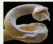
Electron micrograph of an adult lungworm

Once swallowed, the larvae migrate to the heart where they will develop into adult