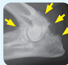
Arthritic elbow joint in a dog with lots of "fluffy" new bone (yellow arrows) around the joint, indicative of marked arthritis.