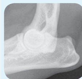
X-ray of a normal elbow joint

Radiography is commonly used to investigate joint problems.